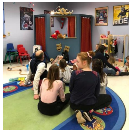
Puppet show with new babysitting course grads!