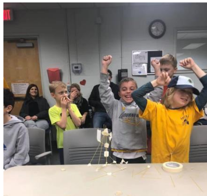
Engineering fun with PEA robotics team!