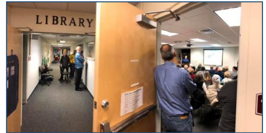
Standing room only @ Kilimanjaro program: 70+ attendees