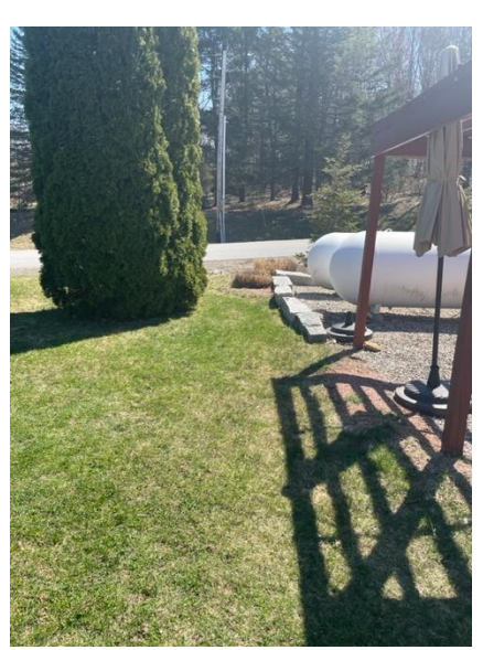
Figure 3 Location Option #2