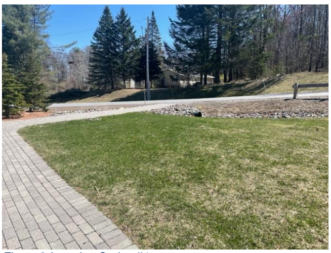
Figure 2 Location Option #1