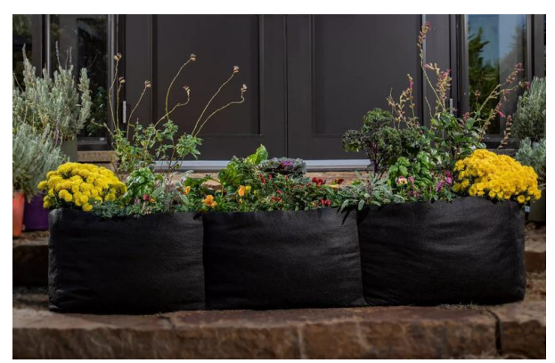
Figure 1 Sample Raised Bed Planter