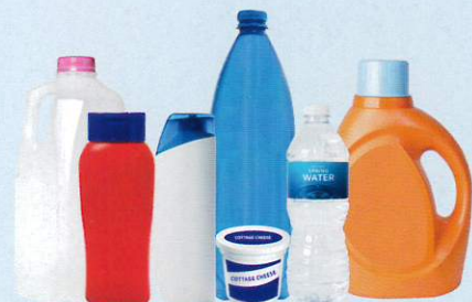
Plastic Bottles, Jugs, Tub & Lids (Empty kitchen, laundry & bath containers)