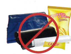
PLASTIC WRAP, FILMS, OR TARPS