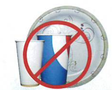
WAXY COATED PAPER ITEMS