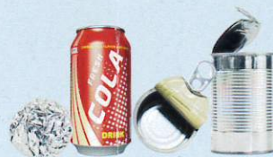
Aluminum & Steel Cans (Foil & empty food & beverage cans)