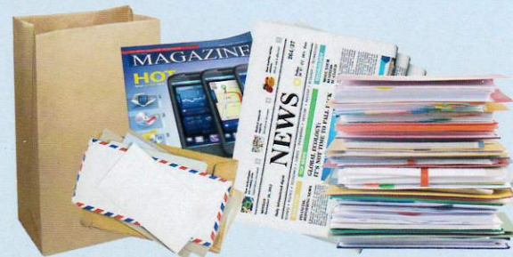
Junk Mail, Periodicals & Office Paper (Paper bags, envelopes & catalogs)