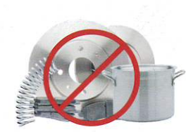
SCRAP METAL ITEMS