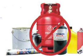
HAZARDOUS MATERIALS OR EXPLOSIVES