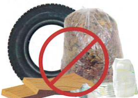
WOOD, WASTE, OR TIRES