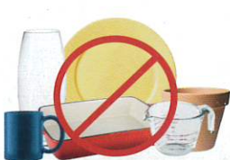
CERAMICS OR BAKING GLASS

For information about Residential Curbside Terms & Conditions, visit casella.com/residential-terms