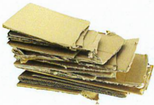
Corrugated Cardboard (Wavy center layer)