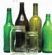
Glass Bottles & Jars (Empty food & beverage bottles & jars)