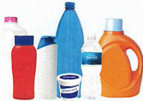
Plastic Bottles, Jugs, Tub, & Lids (Empty kitchen, laundry, & bath containers)