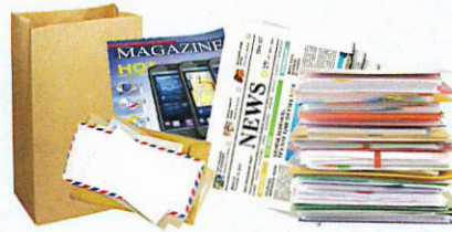
Junk Mail, Periodicals, & Office Paper (Paper bags, envelopes, & catalogs)